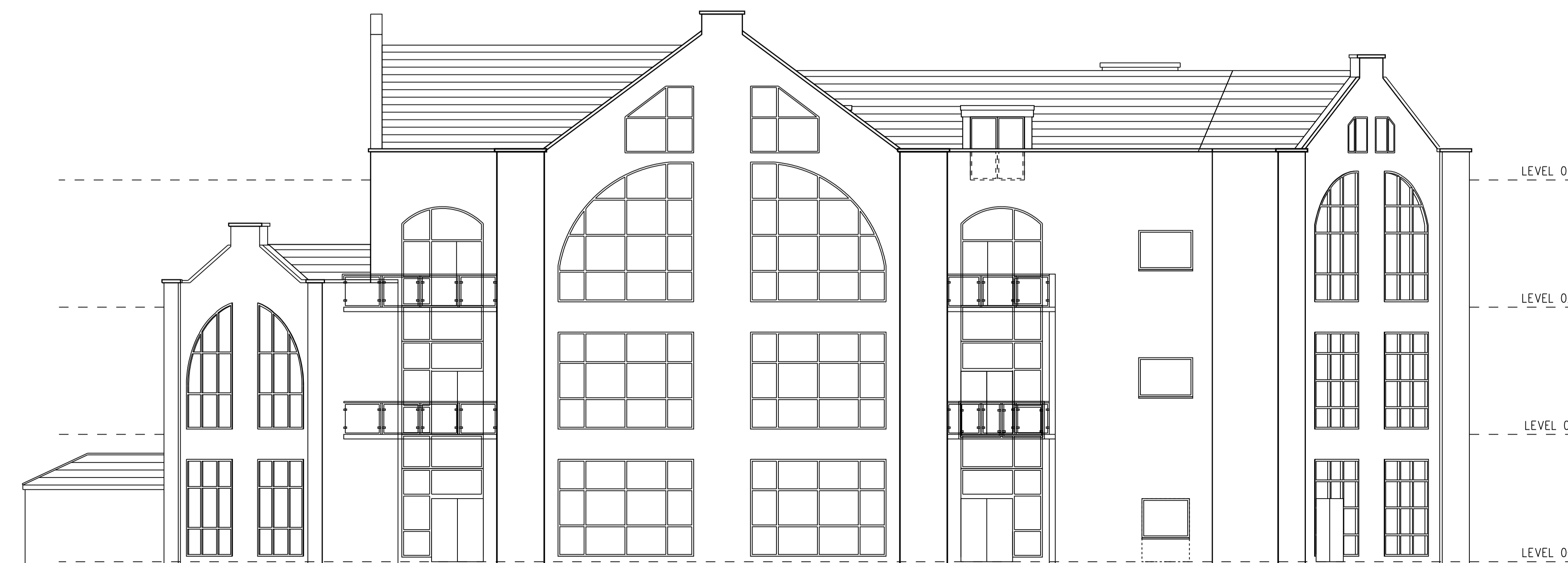
PROPOSED REAR (RIVERSIDE) ELEVATION