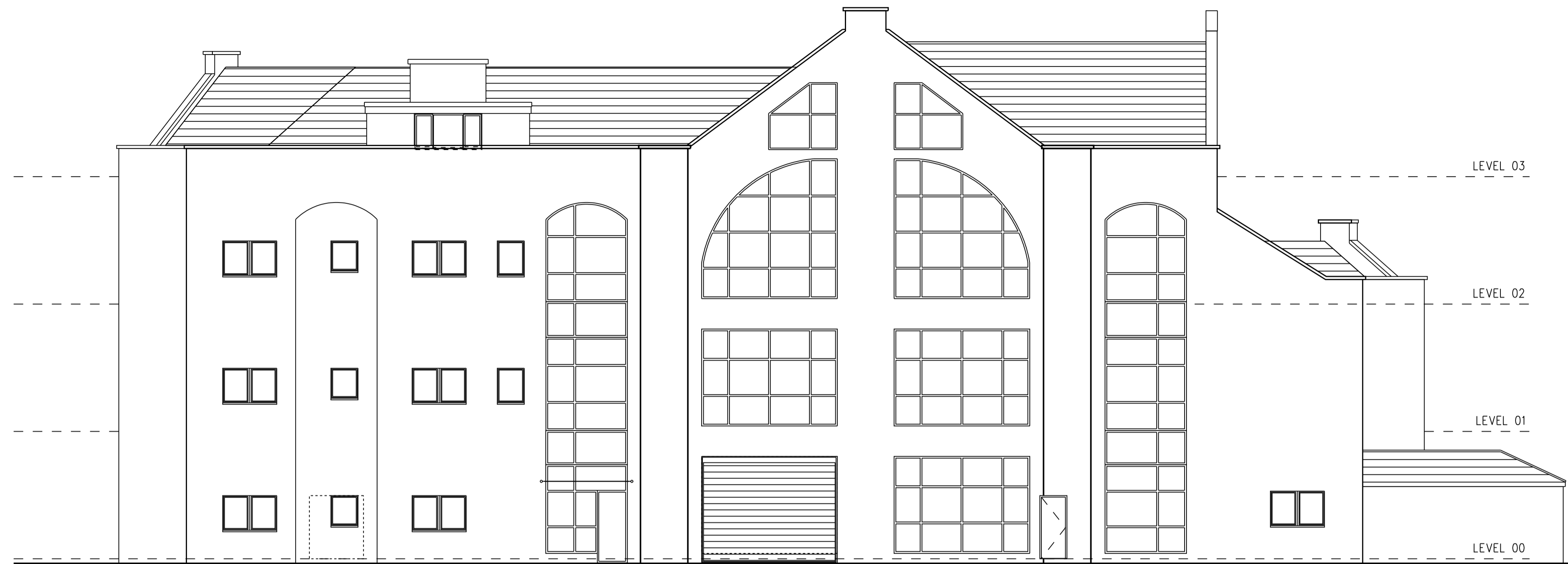
PROPOSED FRONT (LONG ROW) ELEVATION

REVISION DATE / DESCRIPTION REVISION 'A' - 27.01.17 - APERTURES UPDATED TO MATCH FLOOR PLANS REVISION 'B' - 24.04.17 - UPDATED TO MATCH PLAN CHANGES REVISION 'C' - 12.05.17 - GENERAL UPDATE TO MATCH PLAN CHANGES